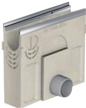
T1500-CB620-13 Galvanized Edge

MIFAB®'s T1500-CB620 Catch Basin shall be 19.7"(500mm) long with a 4" (100mm) internal width. The catch basin 23.6" deep. It is available with a 4" or 6" outlet. A sediment bucket is included with every basin. The catch basin is made from High Strength Polymer Concrete. Each channel comes with a Galvanized edge rail or Stainless steel edge rail. The catch basins achieve Load Class A-E depending on the grate utilized. T1500-CB620-4 is only Class F.