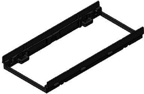
200-DI Ductile Iron Frame

NOTE: THIS DUCTILE IRON RAIL WILL NOT ACCEPT STARFIX GRATES. PRO-FIX AND 8-POINT LOCK ARE THE ONLY SECURING METHODS.