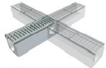
Fig.: Element as 4-way