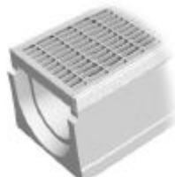
female end (I)