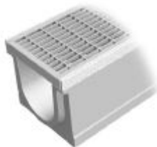
male end (O)