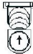
Open End Piece with 4" Pipe Connection Part.No.: CHG70011-20