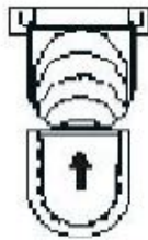
Closed End Piece Part.No.: CHG70011-10