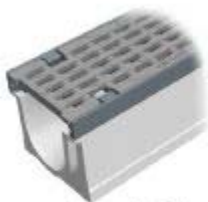
male end (O)